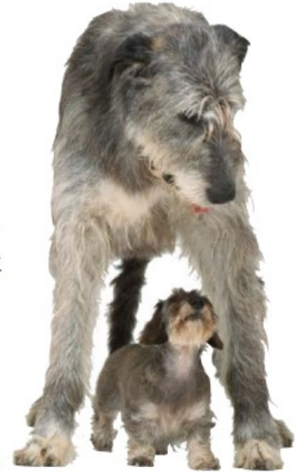
Irish wolfhound with terrier pal

Hounds may bark to let a hunter know they have cornered the game, or they may kill the game themselves.