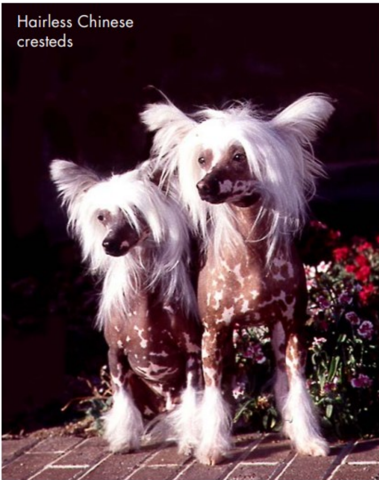
Hairless Chinese crested

The hairless Chinese crested is bald except for puffs of hair on the head and feet. It has dark gray skin with pink spots. It needs sunblock lotion in the summer. In the winter, it needs to wear a coat to stay warm.