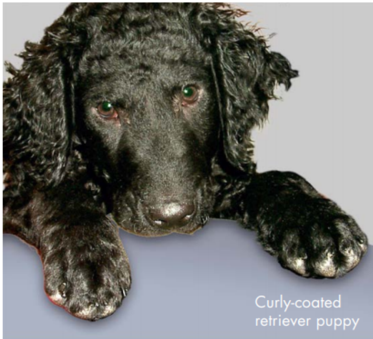
Curly-coated retriever puppy