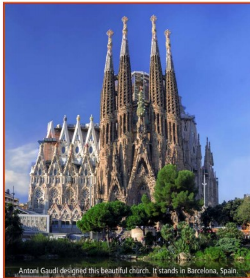
Antoni Gaudí designed this beautiful church. It stands in Barcelona, Spain.

Spanish people eat three meals a day. Lunch is their biggest meal. Many people like to eat rice with fish, beans, salads, pork, or lamb. Then they might have dessert, too!