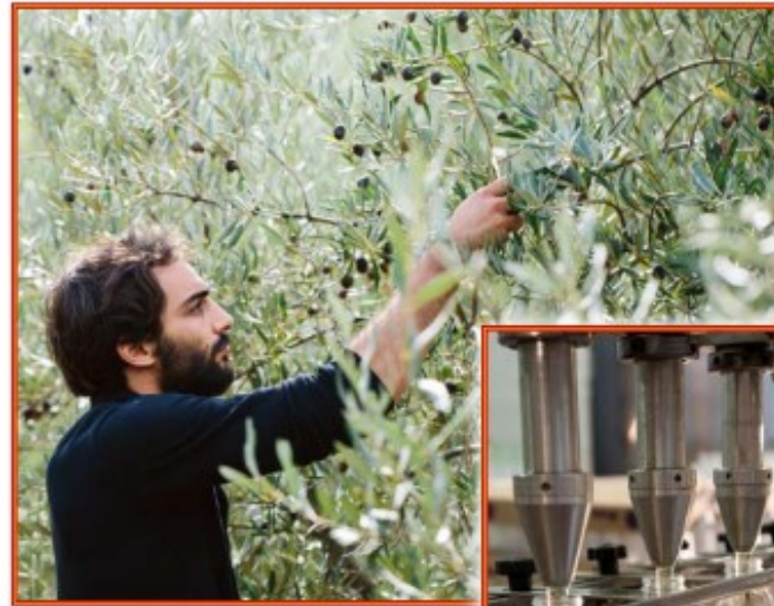
Farmers grow more than two hundred types of olives in Spain. Spain is the world's largest maker of olive oil.