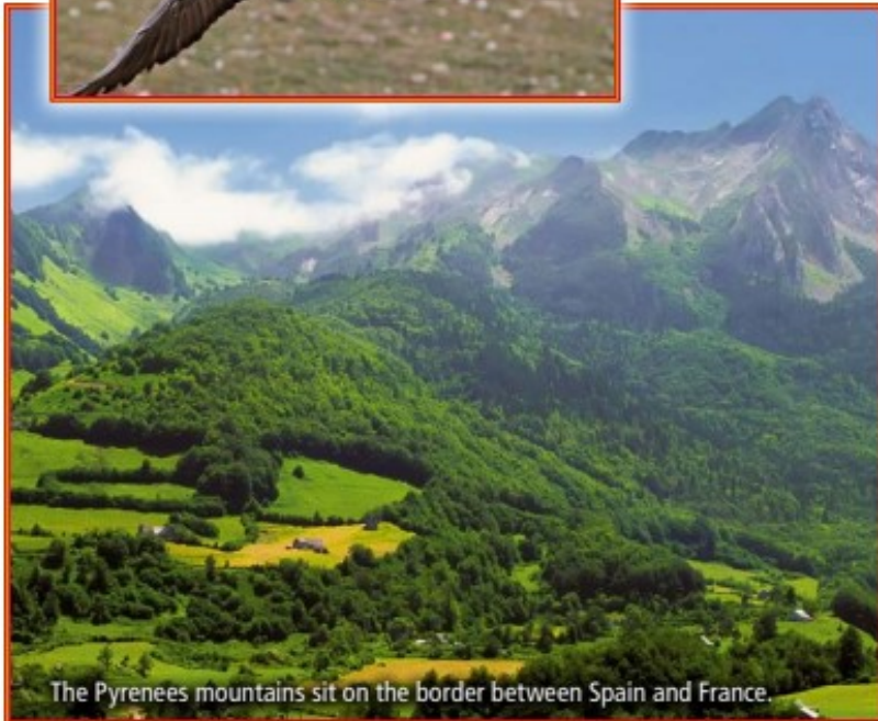
The Pyrenees mountains sit on the border between Spain and France.