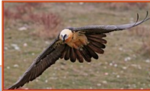
The bearded vulture is a rare bird in Europe. It nests on high ledges.

The mountains are 434 kilometers (270 mi.) long. They stretch from the Mediterranean Sea to the Atlantic Ocean. Different animals, such as the bearded vulture, live in the mountains.