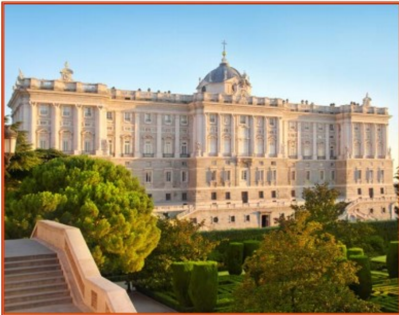
The Royal Palace in Madrid has more than two thousand rooms.

The palace is one of its biggest buildings. It used to be home to the Spanish king and queen and their family. Today, the family lives in a much smaller palace outside of Madrid.