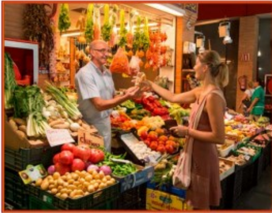
A woman buys fruit in a market in Seville, Spain (above). Workers prepare clothing to be sold in stores (right).

People in Spain speak Spanish. Almost all people who were born there speak this language.