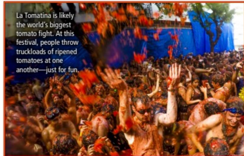
La Tomatina is likely the world's biggest tomato fight. At this festival, people throw truckloads of ripened tomatoes at one another—just for fun.

La Tomatina is a festival that happens every year in Spain. People throw tomatoes at one another and have fun.