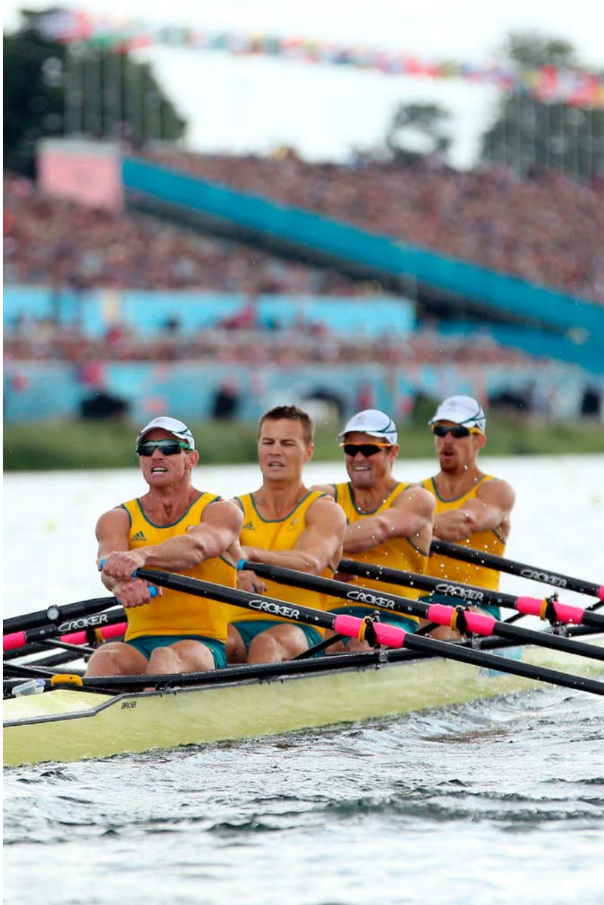
Some athletes row.