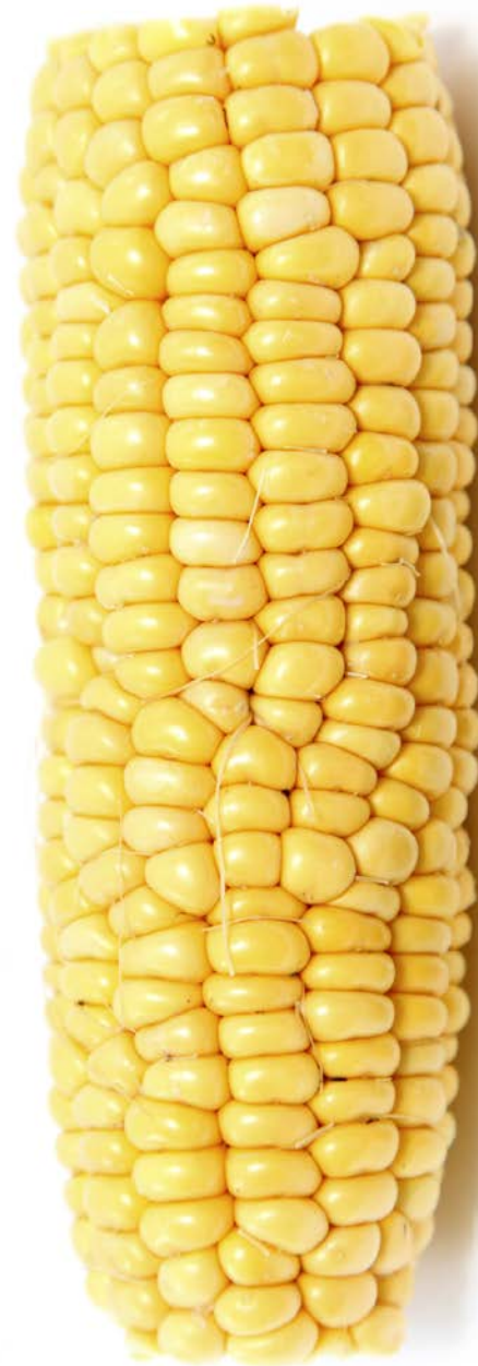
This is corn.