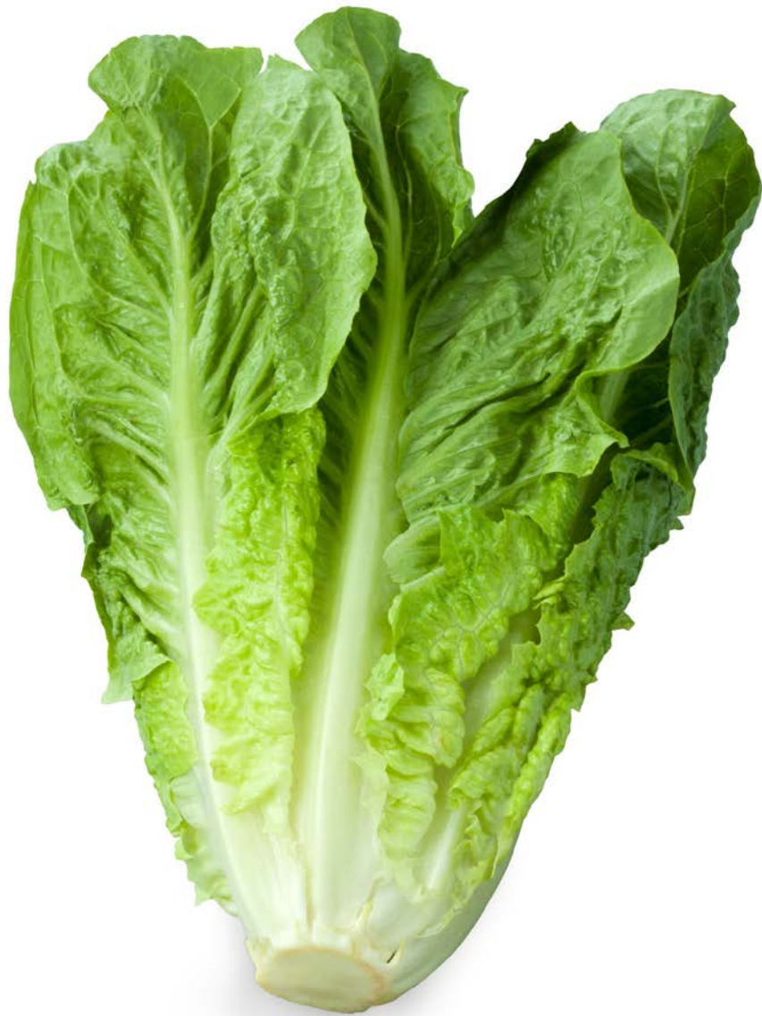
This is lettuce.