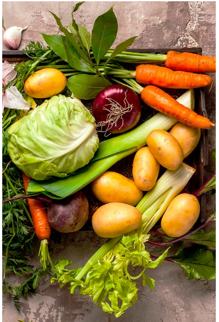
These are vegetables.