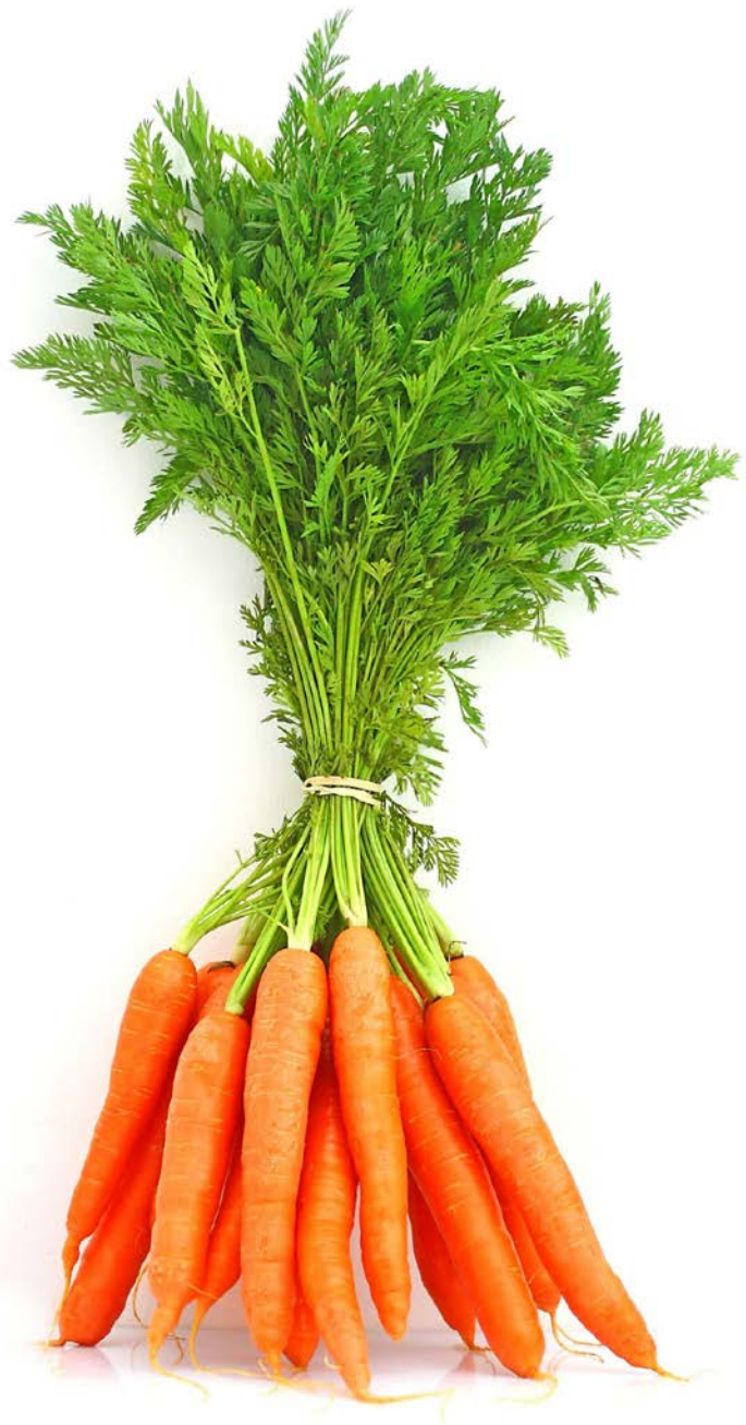
These are carrots.