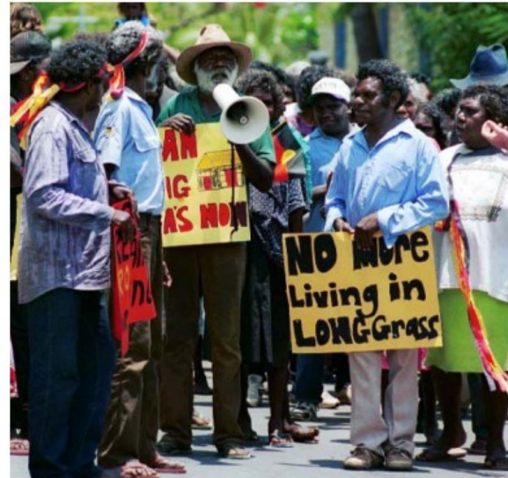
Modern Aborigines still fight against discrimination.

A huge depression (a period of poverty) struck Australia in 1929. By 1931, one out of every three workers was unemployed, and many were homeless. Business and the economy improved from 1934 to 1937. During World War II, Australians fought alongside Allied soldiers.