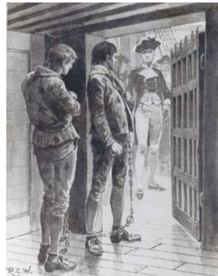
This drawing shows prisoners on a ship sailing to Botany Bay, Australia, in 1770.

Finally, in 1770, an Englishman, Captain James Cook, arrived in Australia. He claimed Australia's east coast for Britain, calling it New South Wales. Because of crowding in British prisons, England established a convict colony (a settlement of prisoners) in Australia. The first settlement had