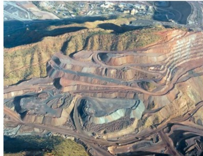
While Australia has little farmland, it is rich in minerals and precious gems.

Australia's other big cities include Melbourne, Brisbane, Perth, and Adelaide. Like almost all of Australia's cities, these are right along the coast.