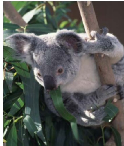
Koalas eat only one thing: eucalyptus leaves.

Koalas look like teddy bears, but they aren't bears at all. They're actually related to the kangaroo, another common Australian animal. Koalas are the only animals besides primates (a group of animals that includes humans, apes, and monkeys) that have unique fingerprints.