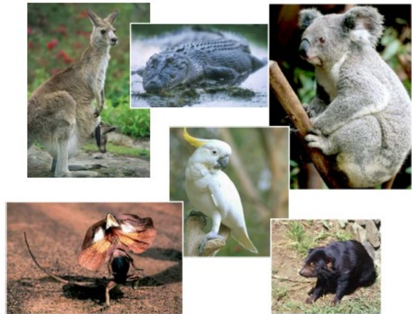
(Clockwise from top left) Kangaroos, crocodiles, koala bears, Tasmanian devils, cockatoos, and frilled lizards have become symbols of Australia.