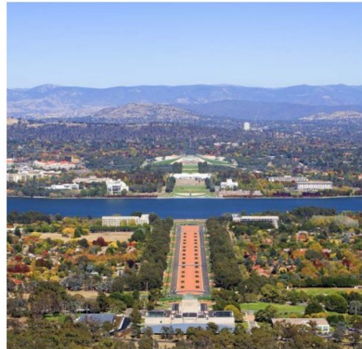
Looking down on Canberra

Australia's capital city is Canberra, which is within New South Wales. Although it is the center of politics and government, it has some small-town charms. There are only around 500,000 residents. The city has art museums, the High Court of Australia, the Australian National University, and other important places.