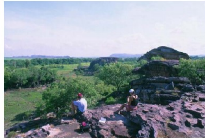
Australia is one of the world's richest natural areas.