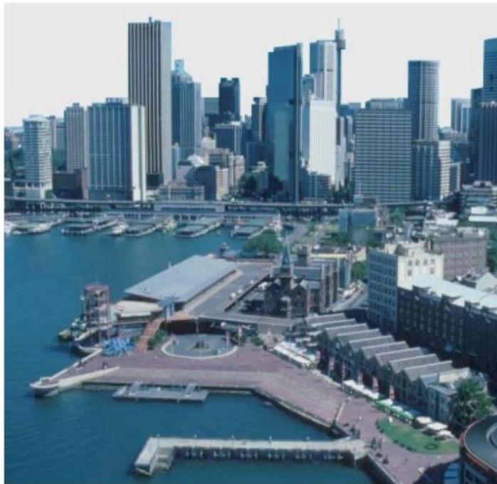
Most Australians live in coastal towns and cities, such as Sydney.

To learn more about the fascinating country called Australia, simply turn the page. Welcome to Australia!