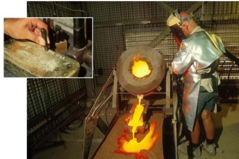
A worker pours liquid Australian gold into a mold to create a standard weight gold bar.

Gold was discovered in New South Wales and in Victoria in 1851. In the gold rush that followed, men from all over Australia, as well as European and Chinese immigrants, rushed to the gold fields. Some found gold and became wealthy, while others did not.