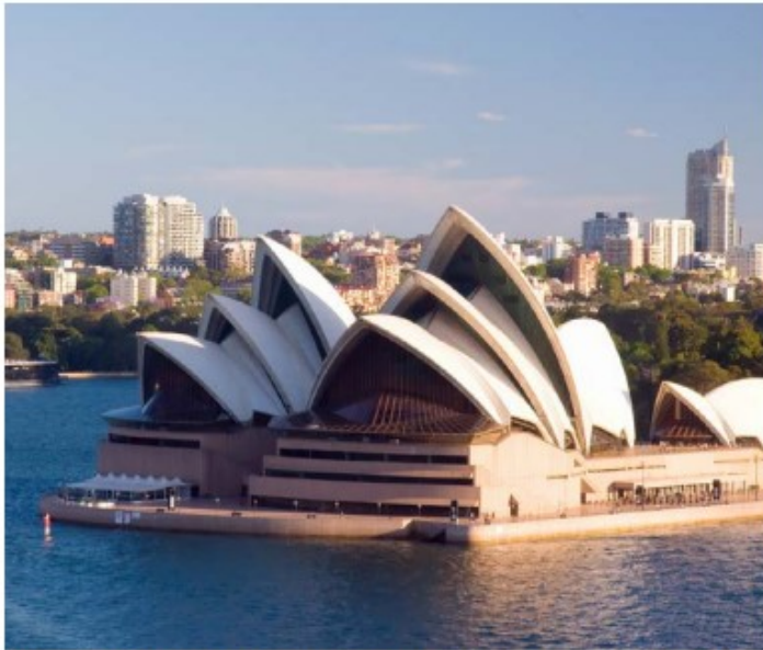
Sydney's opera house is one of the most famous and unusual buildings in the world.

Sydney is Australia's largest city, with a population above four million. Within the city lie a business district, Chinatown, The Botanic Gardens, museums and art galleries, and many old buildings. Surrounding the city are national parks filled with plants and animals. Sydney is also home to some of the most beautiful beaches in the world.