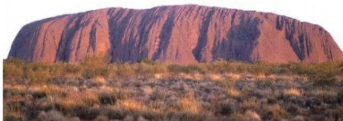
Uluru, also known as Ayers Rock, is one of the most famous sights in Australia.