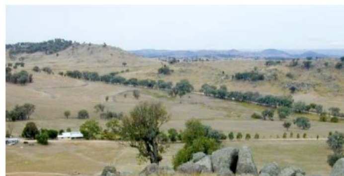
Stations in the outback seem to go on forever.

Some residents of the outback live and work on enormous ranches called stations . Some stations are actually larger than some small countries! Other people work in mining and oil production. The only city in the outback, Alice Springs, welcomes tourists who come to visit Uluru.