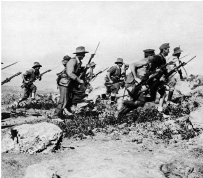
Australian soldiers have fought in major wars.

The colonies became states. In 1901, they united under one government and called themselves the Commonwealth of Australia. Britain entered World War I in 1914, with Australia fighting alongside.