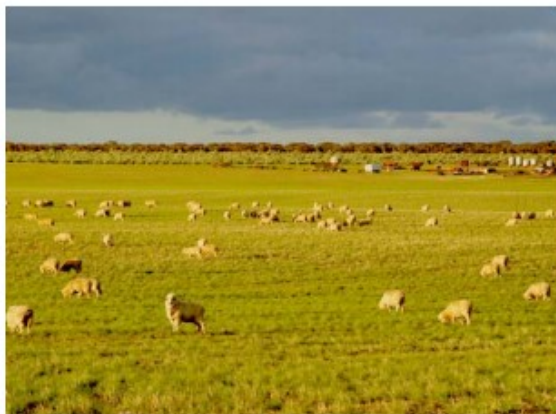
Much of Australia is open ranch land with few roads.

In 2003, approximately 20 million people lived in Australia. Of all Australians, about 92 percent are Caucasian, or white, and 7 percent are Asian. Today, 350,000 Aboriginal people live in Australia. Almost every single Australian adult can read!